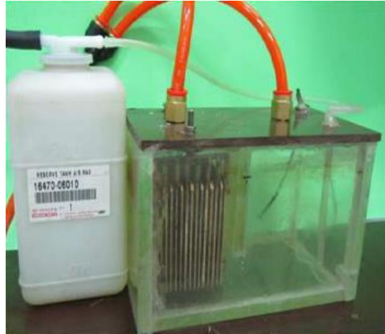
Fig. 2. Wet cell type [47]

dry and wet cells. For the same design parameters, wet cells produce more HHO gas than dry cells because all electrodes are immersed in the electrolyte solution. The active surface area of the electrodes is enhanced. Dry cells generate less heat, have fewer electrodes that corrode, and take up less space than wet cells.