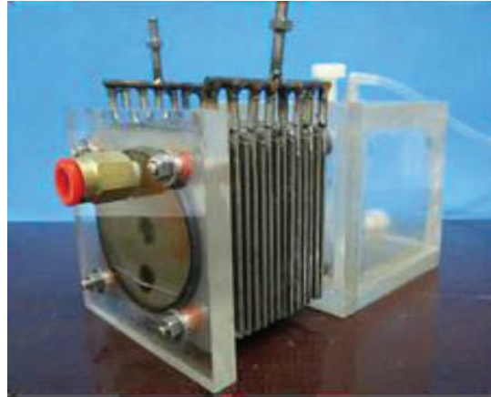
Fig. 3. Dry cell type [47]

to the explosive and diffusive nature of hydrogen, and the presence of water, the introduction of hydroxyl gas from the dry cell into the combustion chamber of an ICE initiates complete combustion which subsequently decreases the potential for NOx generation. Their findings show good agreement with Ismail et al. , [53].