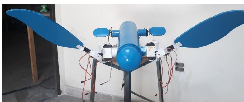
Fig. 3. Final UROV Model