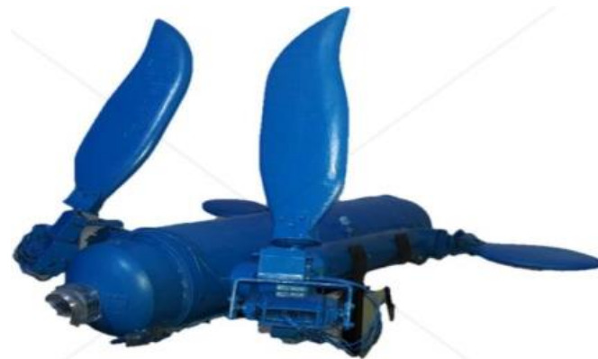
Fig. 2. UROV Assembly with Flappers

Assembly of UROV with flappers are shown in Figure 2.