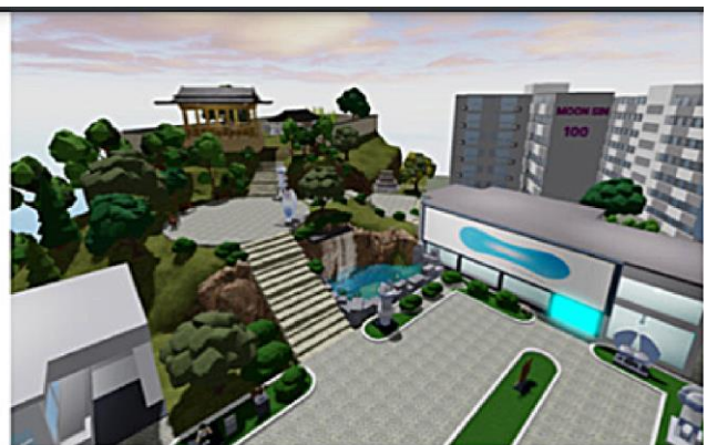
(b) Outdoor of Moonshin Art Museum