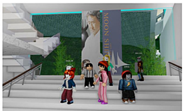
(d) User in Main Hall of Moonshin Art Museum