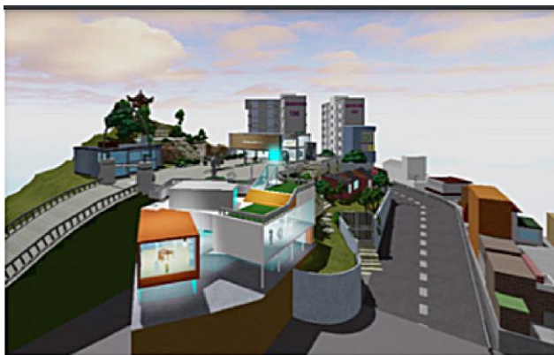
(a) Moonshin Art Museum in Roblox

The integration of digital technology in art education has significantly increased self-awareness and connectivity, blurring the boundaries between real and virtual environments [39-55]. This has improved communication, expanded thinking, and fostered collaboration. Art education has also forged connections with non-heritage culture, preserving its essence and enhancing fault diagnosis. The use of ethno-design technologies has positively impacted students' spiritual well-being [58]. Art educators' adaptability to the COVID-19 pandemic challenges has highlighted resilience and potential for future policy adjustments. The integration of 3D printing technologies in teacher education programs is met with enthusiasm, as it concretizes subjects, increases student motivation, and produces effective teaching materials [60]. These outcomes demonstrate the evolving landscape of art education and its far-reaching benefits (refer to Table 5).