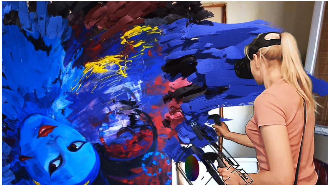
Fig. 1. Virtual reality painting using tilt brush [19]

Furthermore, several studies collectively investigate the transformative potential of modern computer technology in fine arts education, particularly in China. Wang [34] examines the impact of computer-aided technology on education quality and resource expansion in the digital era. On a similar note, Feng et al. , [35] introduce a novel media art education platform employing IoT technology to address issues like real-time output, resource recall, and execution time costs. They employ VXI bus technology for resource acquisition, yielding improved recall and retrieval rates while maintaining relatively low execution time costs. In the context of the 4th Industrial Revolution, Yoo and Lee [36] advocate for a fresh approach to culture and arts education, merging elements from the 3rd Industrial Revolution. Their study assesses the efficacy of existing methods, focusing on the Future Problem-Solving Program (FPSP) centred on sound art to enhance creativity among college freshmen, with positive results indicating potential for future culture and arts education paradigms. These studies collectively emphasize the role of technology in reshaping and revitalizing fine art education.