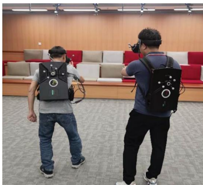
Fig. 3. Students participating in an experiment involving the application of artificial intelligence (AI) and virtual reality (VR) training [38]

In addition to the broader impact of technology on art education, the study delves into the specific benefits of using the 'Aurasma' application in the art curriculum [18]. The integration of this technology not only boosts student motivation but also creates a more enjoyable and flexible learning environment. Moreover, it positively contributes to students' academic performance. By achieving a remarkable 92% student satisfaction rate in art education, this technological innovation optimizes art course teaching at the college and university levels [41]. It offers improved teaching practices, allowing educators to engage students more effectively while attaining educational goals in art courses. This successful application of technology showcases the potential for enhanced teaching and learning experiences in art education, ultimately benefiting both students and educators (refer to Table 4).