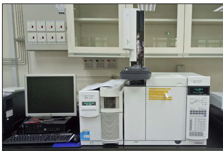
Fig. 1. Agilent 5975C TAD Series GC/MSD system

(Figure 1) Gas chromatography was carried out on an Agilent 5975C TAD Series GC/MSD system equipped with an HP-5 (5% phenyl 95% dimethylpolysiloxane) fused silica (Agilent 19091S-433) capillary column (30m × 0.25 mm; film thickness 0.25 μm), the mass spectrometry detector temperature was set to 280°C. The sample (1 μL, diluted 1:100 with hexane) was injected in a split mode ratio 5:1. The initial oven temperature was set to 70°C for a minute and then up to 185°C at 5 °C/min and held again for a minute. It was further increased to 300°C at a same ramping rate as before. The carrier gas was helium at a constant flow rate of 3 mL/min.