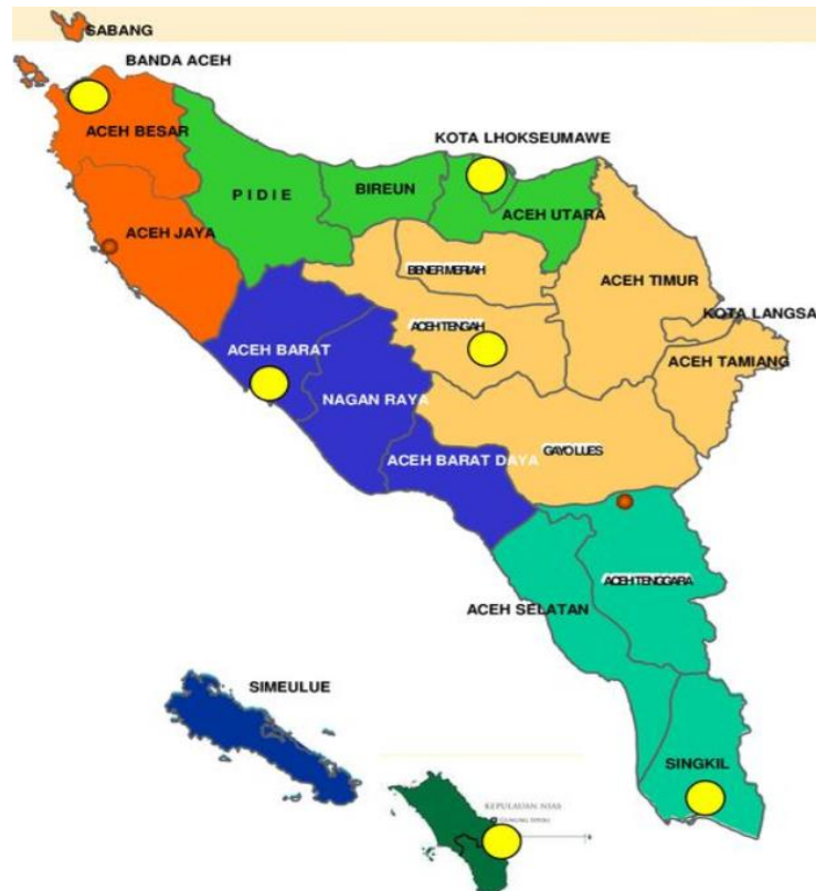
Fig. 1. Map of location data analysis

Materials used in this study include Hi-Volume Sampler and Gas Sampler for air quality analysis. Meanwhile, the content for water analysis used water samples and 1 to 2-liter sample bottles. Air noise analysis used Sound Level Meter to get the sound pressure level with the dBA unit. The locations for analysis of environmental conditions on air quality, water quality and air noise levels consisted of three different places, as shown in the map in Figure 1. The point of analysis of environmental conditions in detail are described in Table 1, based on the area shown in Figure 1.