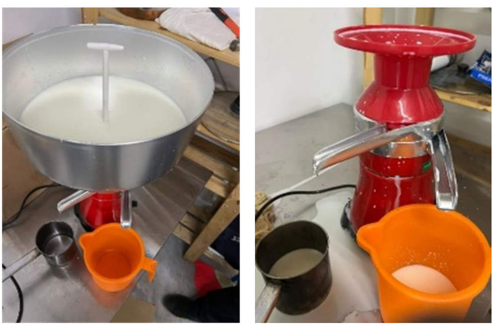
Fig. 3. Diagram of Cream Separator with Leakage of the System due to Excessive Vibration within Parts