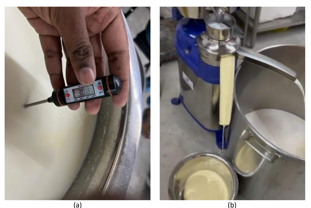
Fig. 2. (a) Diagram of milk is heated up in different desired temperatures and (b) Diagram of different yield of cream and skimmed milk obtained