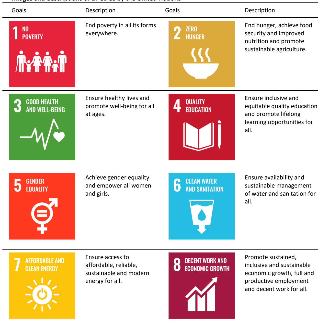
Table 1 Images and descriptions of 17 SDGs by the United Nations

environmental sustainability. In particular, it is said that ‘eradicating poverty in all its forms and dimensions, including extreme poverty, is the greatest global challenge and an indispensable requirement for sustainable development’ in the preamble of the introduction of SDGs, which shows what they emphasize on, by the United Nations [3].