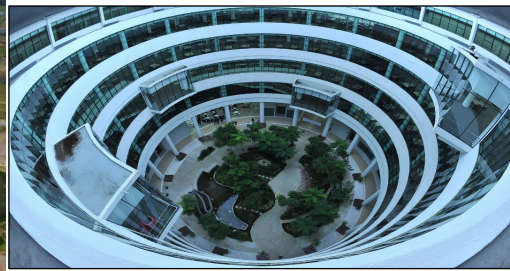
Fig. 2. UTHM library garden in courtyard spaces