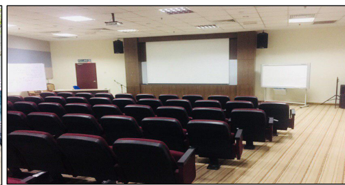
Fig. 4. UTHM library seminar room