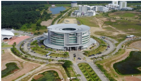
Fig. 1. Aerial view of UTHM library

thermal sensation votes (TSV) between (-1) and (+3), inclusive, divided by total votes. A total of 150 respondents answered the questionnaire with 50 respondents in each investigated place.