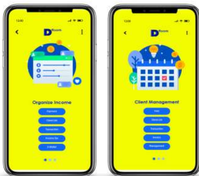
Fig. 2. Mobile mode features in the D'ROOM Designer Professional Solution application (organize income and client management)

Navigating through the diverse offerings of the D'ROOM application, users gain access to a comprehensive array of job categories tailored to various sectors within the design industry. From graphic design and industrial design to UI/UX design and beyond, these curated categories facilitate seamless job searching and networking opportunities. By exploring and engaging with these job categories, users can proactively pursue new professional opportunities, connect with potential clients, and expand their professional network within their specialized field.