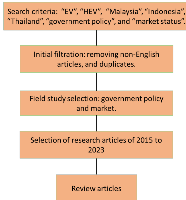
Fig. 2. Literature review process