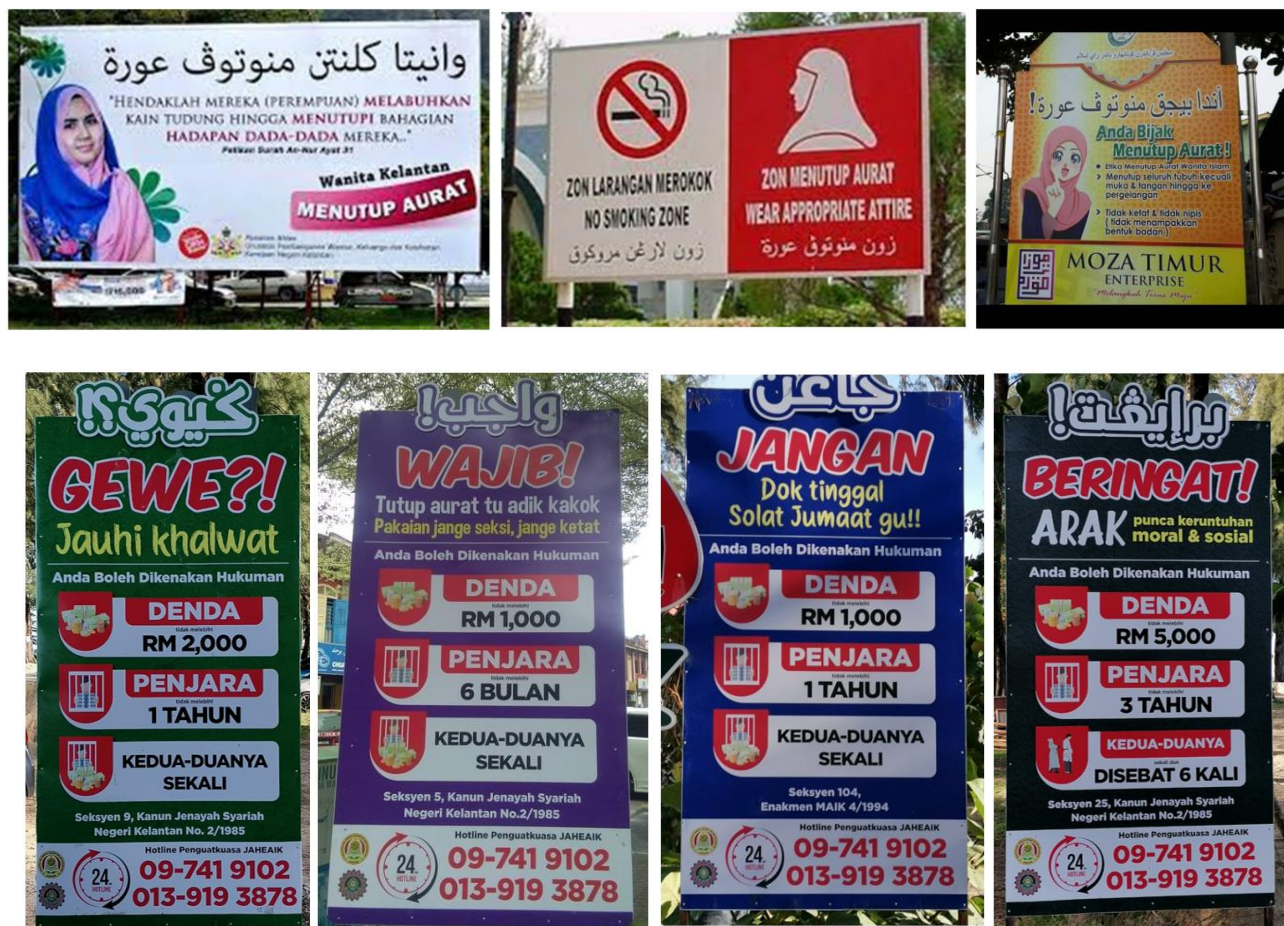
Fig. 2. Reminder of Islamic by-laws