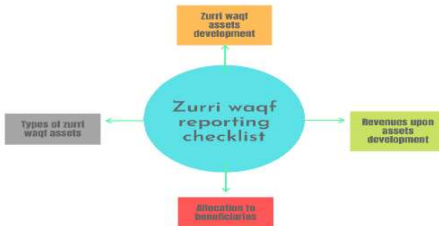
Fig. 1. Items for zurri waqf reporting disclosure

The discussion continues the procedure for content analysis. The effectiveness of information related to each sentence, headline, table, and diagram in the annual reports and websites was assessed manually, following the methodology outlined by Beattie and Thomson [18]. Each element was classified as efficiency-related or not, based on its relevance to indicators of efficiency.